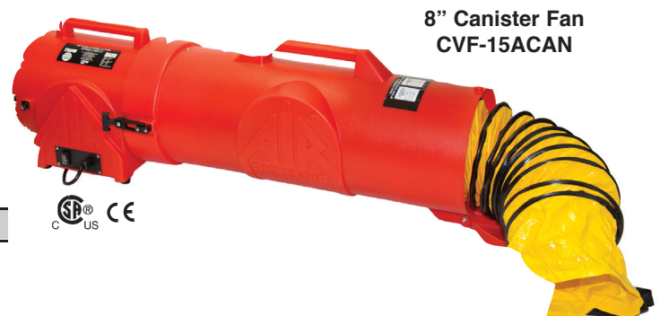
8" Canister Fan CVF-15ACAN