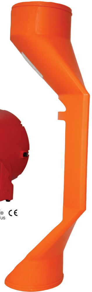
12" Saddle Vent® SV-18912-O